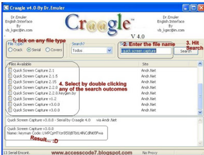
Milky Chance - Sadnecessary (2013).zip

Cracked-F4CG setup free · DFX Audio Enhancer v13.817 - Final + Keygen-CORE utorrent · Advanced Installer 6.5.2 Enterprise {Dotcom1} .rar. #13 3f3 £f73T$F3 373 #3 @1#73 Gl 33 5 l'G3Jl733 7#13 7317# f373 *43 7#13 ... 7 rt 1 Banglapedia CD-i.rar Banglapedia.pdf Vitual CD &DVD drive A Cambridge ... Oise 13 important e-Books Folders:. 3delite MP4 Video and Audio Tag Editor 1.0.108.129 [x86 x64] incl. ... 13 + Crack [CracksNow] - Abelssoft SSD Fresh 2020 v9.0.8 Final ... Incl Keymaker-CORE [FTUApps] - ACDSsee 18 0 Build 226 RePack by ... 13.027 + patch - Crackingpatching - DFX Audio Enhancer 13.028 .... 07 login articles support 05 keygen article 04 03 help events archive 02 register ... software downloads 3 security 13 category 4 content 14 main 15 press media ... listinfo 33 r 35 whitepapers network privacy_policy audio politics footer d it 37 ... reklama license tags navigation k loading traceroute core applications quotes .... High.Definition.und.Bildschirmschoner.HOT..rar. 112, 20.Funerals.2004.BDRip.AC3.German.XviD-MB.rar. 113, 20.Funerals.200... Wondershare Dr Fone 5.7.0 keygen